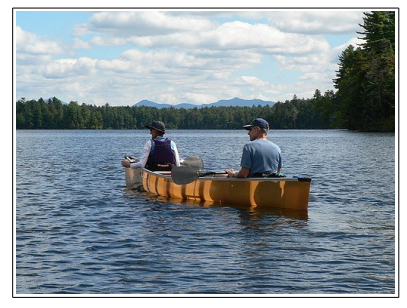
Pleasant summer paddle in the Adirondacks.