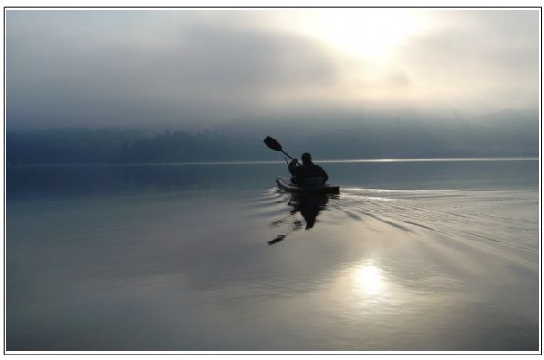
Paddling on Schroon Lake.

To make the most out of your Adirondacks experience, we here at ADKTrailMap.com have assembled a guide to help you have a safe and enjoyable journey while paddling. Remember to review this guide each time you pack for your trip to ensure that you don't leave anything behind.