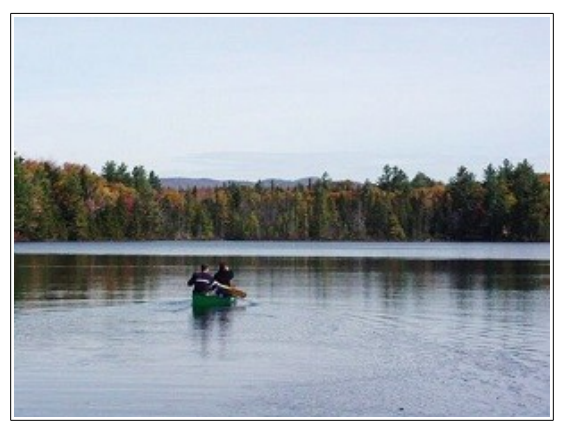
Paddlers on Long Pond in the St. Regis Canoe Area . Photo: NYS DEC

Seven Carries/St. Regis Canoe Area Located in the popular St. Regis Canoe Area (which is the only designated 'Canoe Area' in the DEC Forest Preserve), follow the Seven Carries route for a scenic paddling adventure that can be completed as a day trip or stay overnight at a primitive campsite on the route. Aside from the Seven Carries, the St. Regis Canoe Area has 50 ponds suitable for paddling.