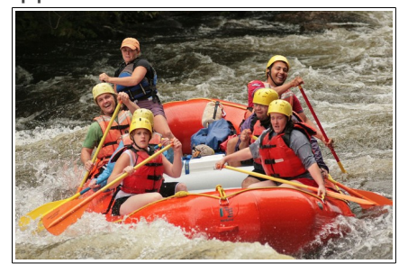
Whitewater rafters on the Hudson River.

Although you may be interested in visiting the Adirondacks to paddle on flatwater, plenty of opportunities for whitewater exist ranging from from family-friendly Class I ripples to intense