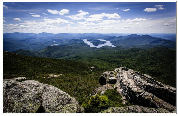
Summit of Whiteface Mountain in the Adirondacks. Yes, it is possible to bike on road the 2,000 ft elevation gain to the summit!

To help you make the most out of your Adirondacks experience, we here at ADKTrailMap.com have assembled a guide to help you have a safe and enjoyable journey while cycling. Remember to review this guide each time you pack for your trip to ensure that you don't leave anything behind.