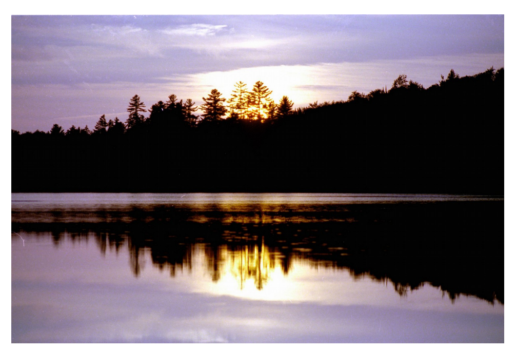
You will see not only fantastic peaks while bicycling along the roads of the Adirondacks, but also sublime lakes and ponds such as this one.

After pitching your tent or parking your camper, ride your bike around the paths of this large Adirondack campground. Trails total more than 4 miles in the entire campsite.