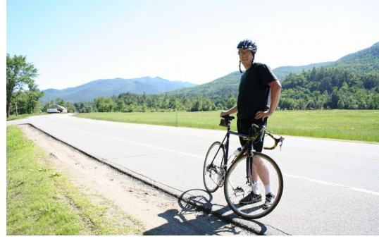
Road biking on a summer day in the Adirondacks.